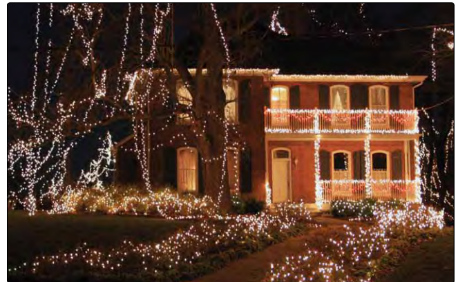
Historic Heald Home in Fort Zumwalt Park

For more information, contact the Office of Tourism and Festivals at 636-379-5614, visit www.ofallon.mo.us/COL or see page 6 in this newsletter.