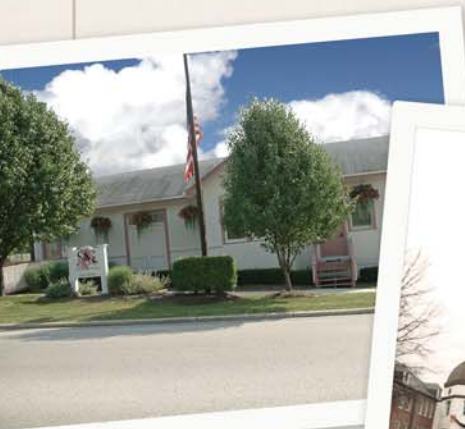
O'Fallon Cultural Arts Center

The City's signature clock tower was dedicated just in time for the Millennium.