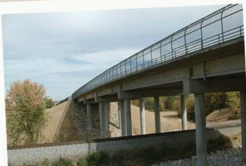
The T.R. Hughes railroad overpass opened October 20, 2004