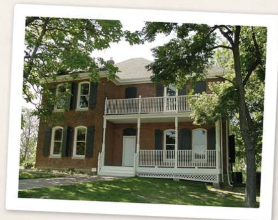
Darius Heald Home in Fort Zumwalt Park