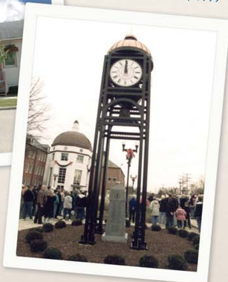
Clock tower dedication, December 30, 1999