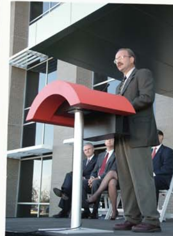
Citigroup ribbon cutting, October 2, 2003