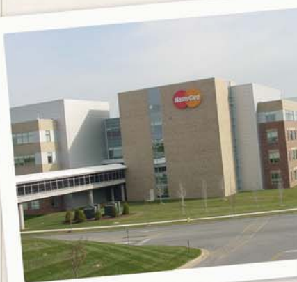
MasterCard International in WingHaven