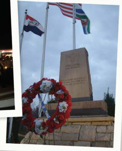
Omer J. Dames War Memorial