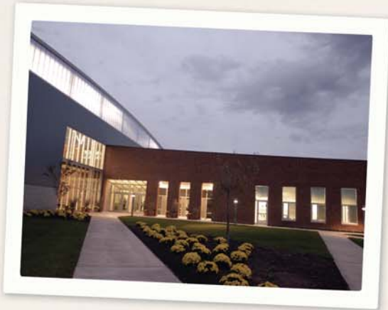
Renaud Spirit Center

Dedicated May 18, 2001, the $1.8 million aquatic center replaced the old city pool with water slides, an interactive water playground for youngsters, lap lanes, a lazy river and a vortex.