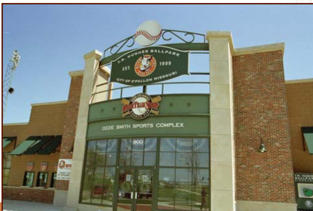
T.R. Hughes Ballpark is home to the River City Rascals minor league baseball team. St. Louis Cardinals greats Ozzie Smith, Lou Brock, Bob Gibson and others helped dedicate the ballpark in 1999.