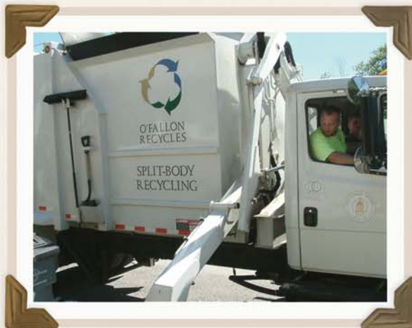
Eighty percent of O'Fallon households participate in recycling.